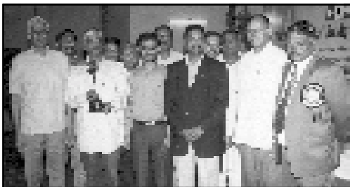
Ruia Trophy Winner - Railway 'A' Team