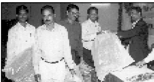
Ruia Trophy Semi-finalist - NALCO Team