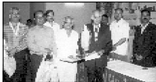
Ruia Trophy Runner - India Blues Team