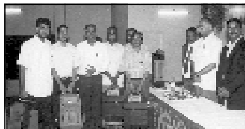
Ruia Trophy Semi-finalist - Railway 'B'